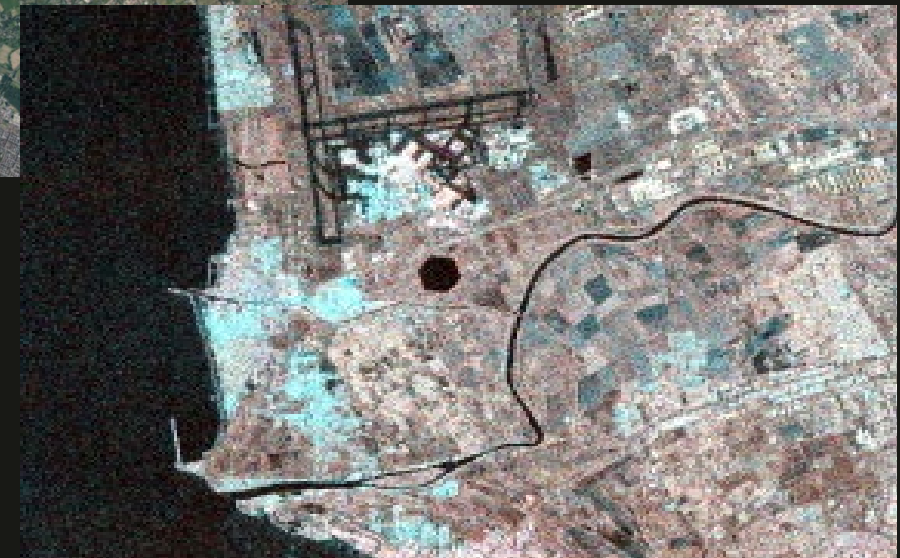
Harbor of Trajan in the first Sentinel-1 acquisition over Rome.