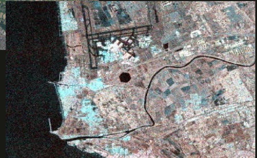
Harbor of Trajan in the first Sentinel-1 acquisition over Rome.